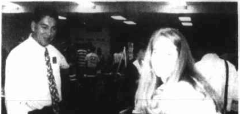
On Wednesday, Oct. 11, a variety of different colleges and armed forces had booths set up in the Veteran's Legion Hall in Columbus to provide information to college-bound students about applications, admission, and financial aid.

This college day allows the students to sign up to be on the mailing list of the places that they are interested in, which will provide them with information for the future.